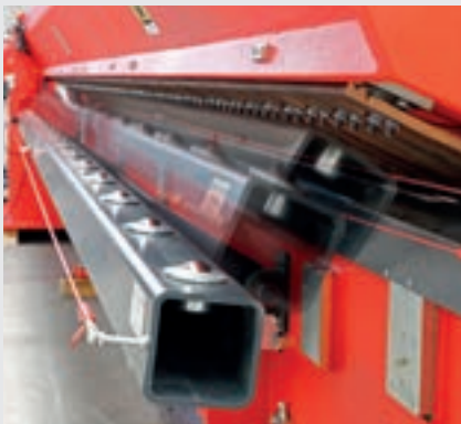
/ Supporting bar with rollers