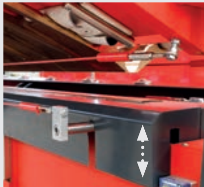
/ Height adjustable lower beam