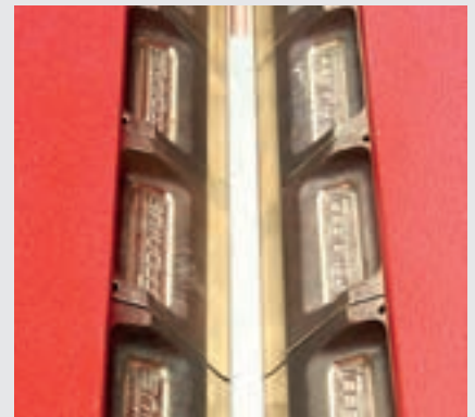
/ Adjustable clamping plates